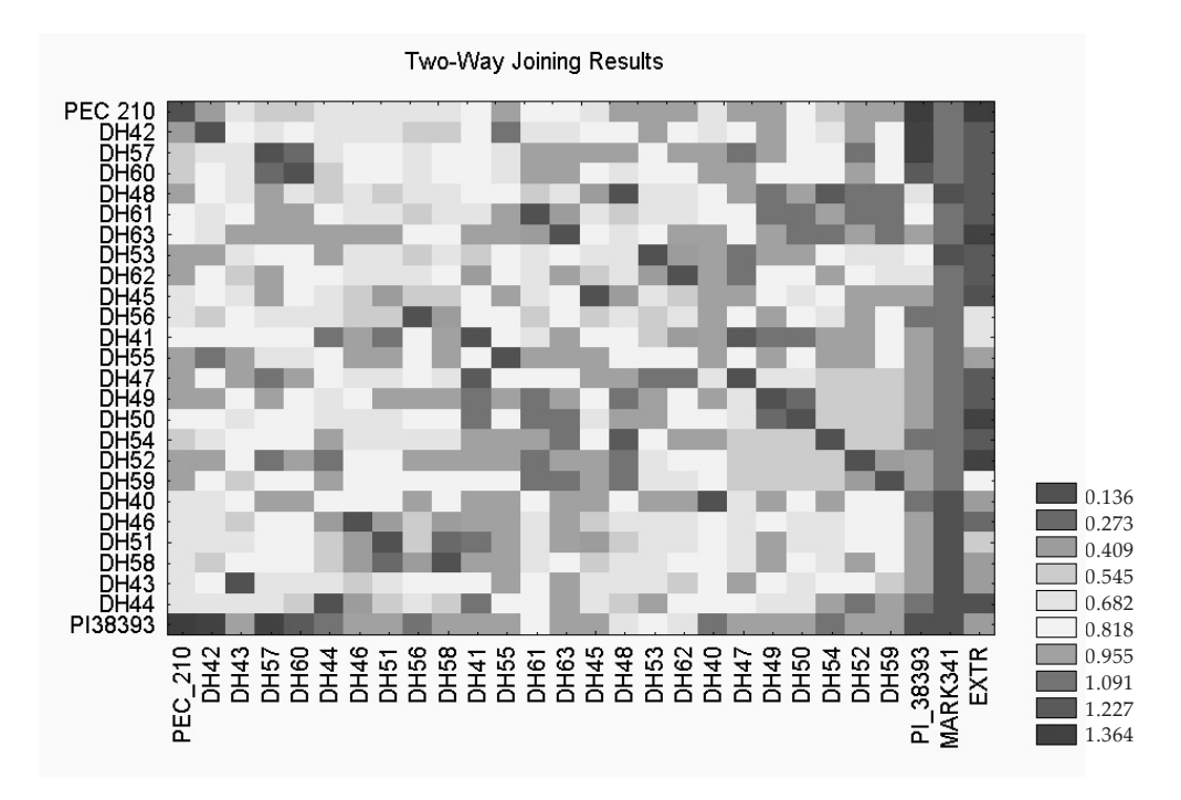
Figure 2. Two-Way Joining Analysis of quality parameters of DH lines

measured as amount of soluble substances obtained from starch by acting of enzymes and genetic distances among accessions. It is apparent, that DH lines: DH54, DH59, DH52 and DH50 forming one sub-cluster and group of lines DH51, DH58, DH46 clustered also together have high value of extract. Coincidence between extract content and the AFLP markers Mse-CAA/Eco-AGC 341 bp and Mse-CAA/EcoRI-ACT 162 was found. Statistically significant differences in malt-extract values (maltextract value 77.9, respective 76.1) were observed between group of the DH lines possessing the AFLP marker CAA/AGC 341bp (DH41, DH42, DH45, DH47, DH49, DH50, DH52, DH54, DH55, DH56, DH57, DH59, DH60, DH61, DH62, DH63) and DH lines without marker (DH40, DH43, DH44, DH46, DH48, DH51, DH53, DH58). High malt-extract lines are included in clusters I - DH42, DH57, DH60 and II – DH47, DH49, DH50, DH52, DH 54, low malt-extract lines are mainly presented in cluster III - DH44, DH46, DH51, DH56, DH58. Thus we showed, that two-way joint analysis is a useful tool for visualisation of coincidence of putative markers with selected traits. The putative marker will be further verified, cloned, sequenced, evaluated and optionally used for MAS.